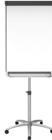
$429 00 Premium Magnetic Mobile Presentation Easel - Adjustable Height, 2x3 Surface QRT ECM32P2