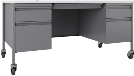
$1031 00 Fortress Series Mobile Double-Pedestal Teachers Desk - 60Wx30Dx29.5H - Double Pedestal - Gray Finish LLR 66946

GIVE YOUR OFFICE THE FREEDOM OF MOVEMENT