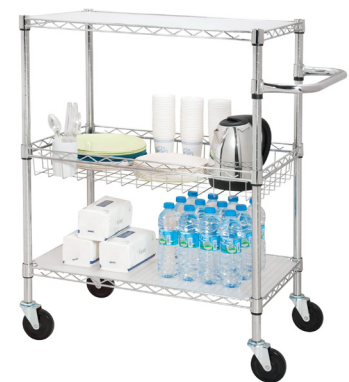
$218 00 3-Tier Mobile Serving Cart - 99 lb Capacity - 4 Casters - Steel - x 18" Width x 30" Depth x 40" Height - Chrome LLR 84858