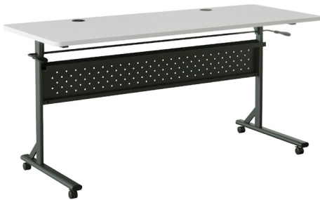
$288 00 Shift 2.0 Flip and Nesting Mobile Table - 60" Table Top Length x 24" Table Top Width x 1" Table Top Thickness - 29.50" Height - Gray Top/Black Base LLR 60766