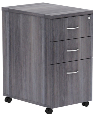
$271 00 Box/Box/File Mobile Pedestal - Weathered Charcoal - 16" x 22" x 28.3" LLR 69560