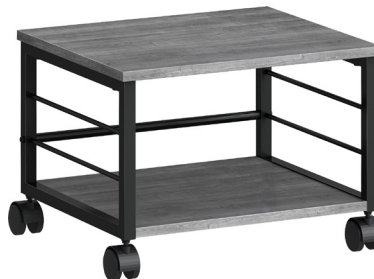
$81 00 Underdesk Mobile Machine Stand - 150 lb Load Capacity - 13.2" Height x 18.7" Width x 15.7" Depth - Charcoal Laminate LLR 60262