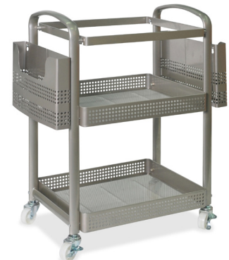
$122 00 Mobile File Cart - 12.5" Length x 22.4" Width x 25.3" Height - Metal Frame - Supports Letter/Legal LLR 45654