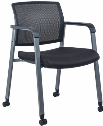
$226 00 Mobile Mesh Back Guest Chair - Black - 1/EA LLR 30953