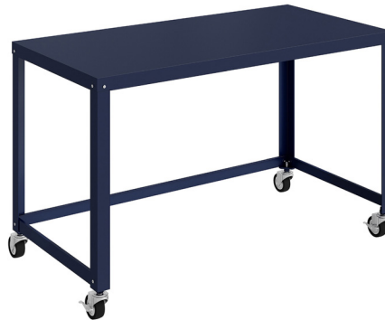
$215 00 Personal Mobile Table Desk - 200lb Capacity, 48"L x 24" W x 30" H - Navy LLR 18335